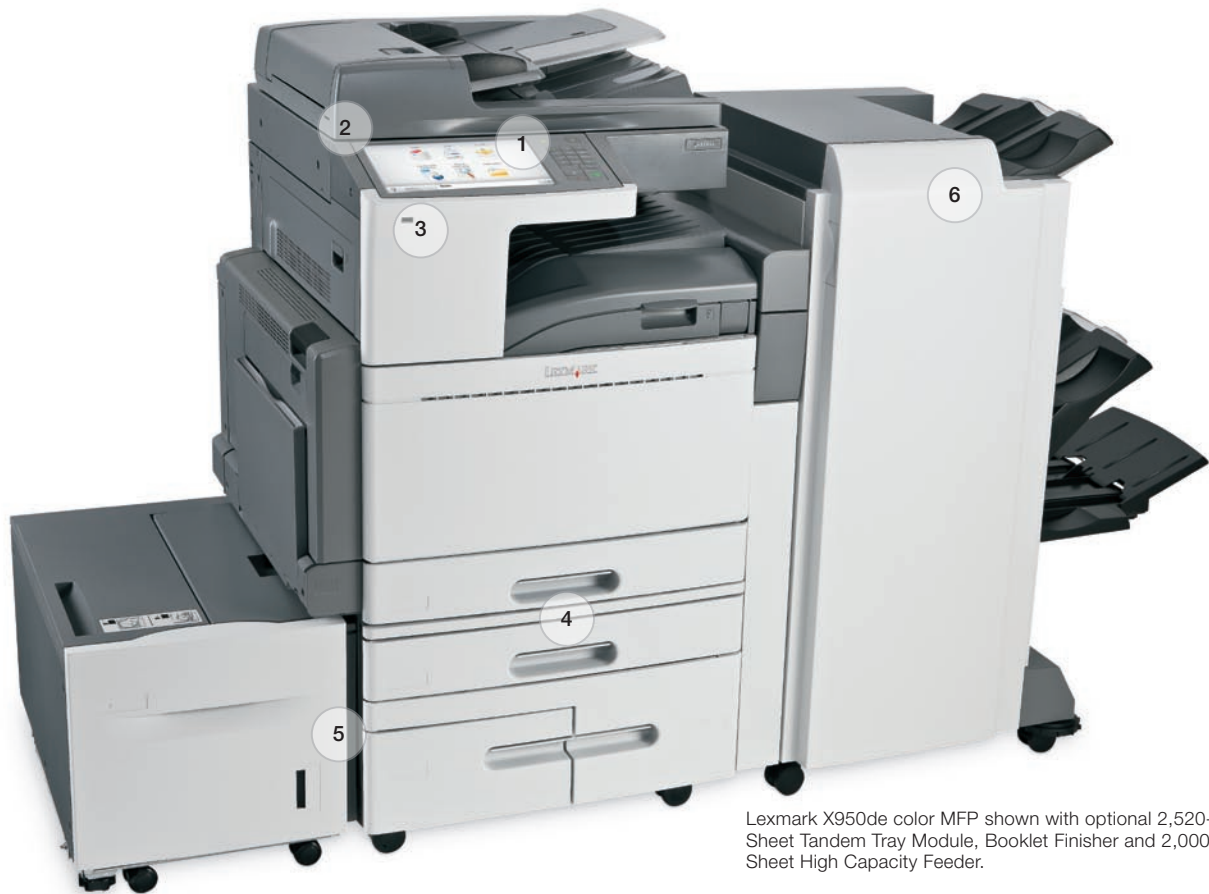
Lexmark X950de color MFP shown with optional 2,520-Sheet Tandem Tray Module, Booklet Finisher and 2,000-Sheet High Capacity Feeder.